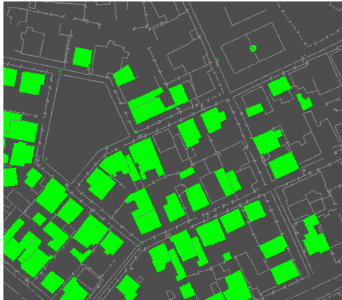
Figure 1: Image showing parcel boundaries

Within an IFC context, a land parcel is considered to be a spatial type of space. The nearest entity match to the concept within IFC 2x2 is that of a site (IfcSite). A site is defined as ‘ A defined area of land, possibly covered with water, on which the project construction is to be completed. A site may be used to erect building(s) or other AEC products ’. This does not match the precise concept of a land parcel since a parcel could contain several sites or a site contain several land parcels.